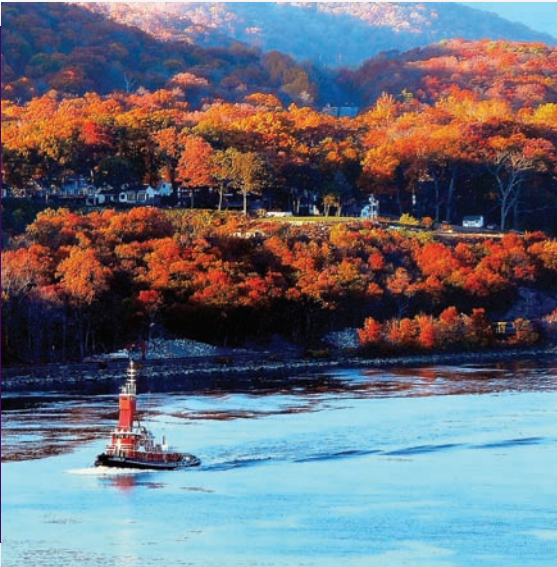
A scenic view of Orange County and the Hudson River.

Catholic Charities Community Services of Orange County, as one of the human service agencies of Catholic Charities of The Archdiocese of New York, is committed to building a compassionate and just society. Catholic Charities Community Services of Orange County serves the homeless, the hungry, the emotionally and physically handicapped, immigrants, and the marginalized and vulnerable of Orange County. We collaborate with parishes and non-Catholic and Catholic partners. We help people of all religions who are in need.