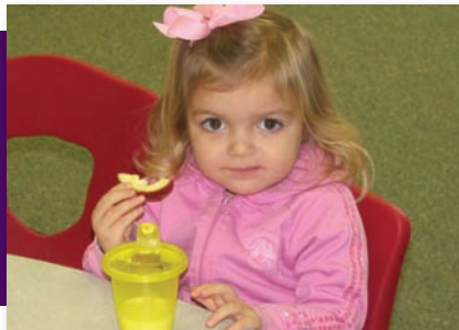
Photo Left Center: A counseling session through Employee Assistance Program.

Photo Left: A child in the Early Learning Center enjoys a break from morning activities.