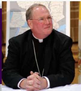
Photo Right Center: Orange County public officials at dedication of Housing Resource Center. Photo Right: Archbishop Timothy Dolan in front of a map of the New York Archdiocese.