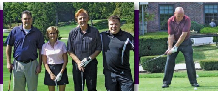
Photo Right Center: A foursome at September golf outing to benefit CCCSOC programs and services.

less than five years of age to make giant intellectual and physical strides. The Center is now licensed and prepared to care for infants as young as 6 weeks. To allow for the increase of services, the Early Learning Center constructed a room dedicated solely to the care of infants and another for toddlers. This expansion of services to infants and toddlers is part of the school's overall commitment to providing the highest quality of early childhood development. The Center's full day program utilizes a Montessori approach taught by certified teachers and includes a developmental program for kindergarten readiness. The Center is located at 59 John Street in Goshen.