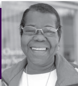
Photo Right Center: Families in need find diverse services and a broad network of referrals. Photo Right: CCCSOC volunteers help provide compassionate assistance to our neighbors.